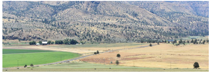
Riverside Ranch Grant County, Oregon, 276 AC +/-